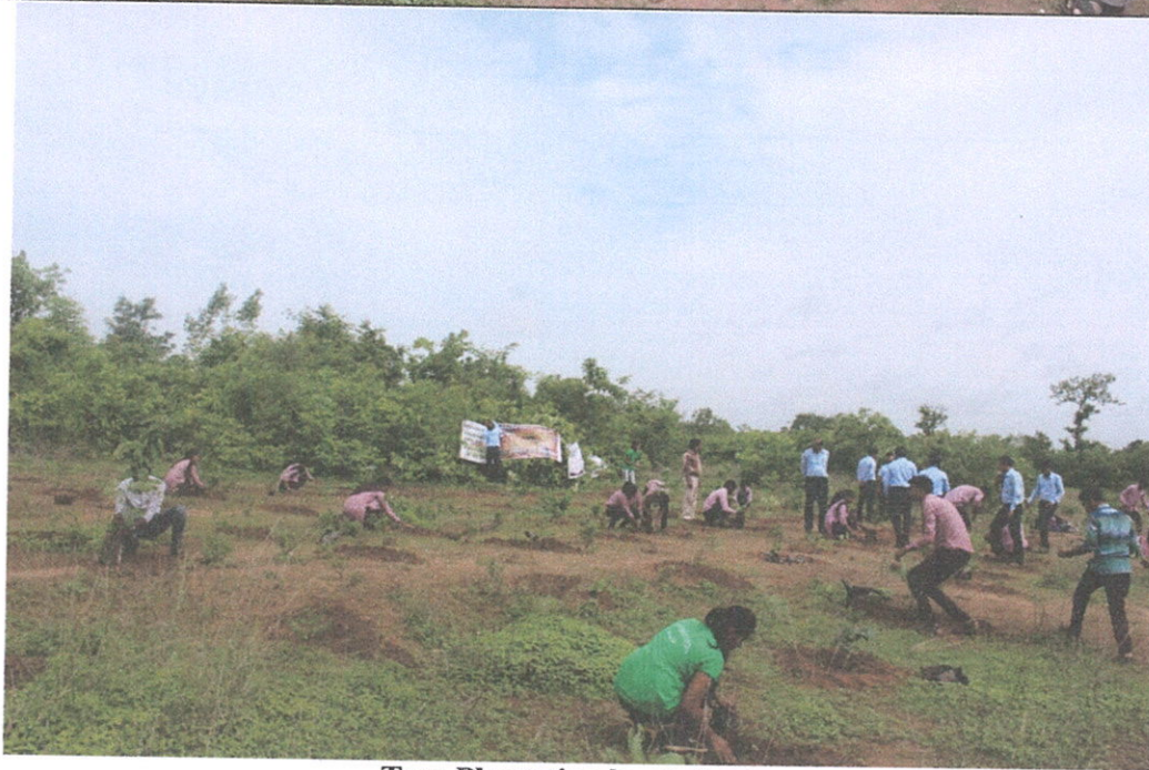
Tree Plantation by students