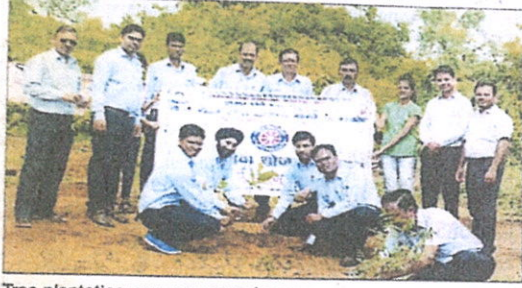
Tree plantation programme underway.